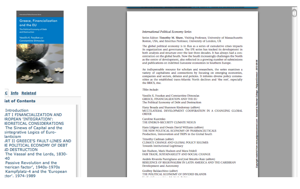
PalgraveConnect reader "view"

Entire books can be viewed onscreen using the embedded site viewer, or saved/downloaded in PDF or ePub formats to a computer or mobile device using a variety of readers: